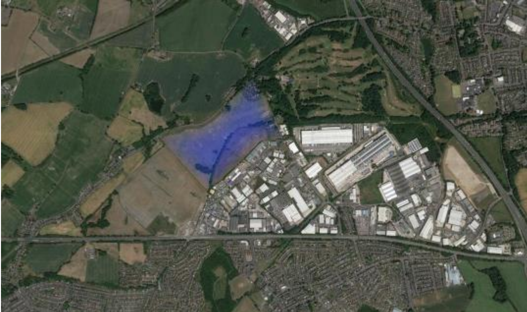
Figure 7: Area of search at land to the west of Haydock Industrial Estate and land west of Millfield Lane

3.47 Conclusion: The area of search is strategically well positioned to accommodate the growth of the freight and distribution market in the Liverpool region in the short term. It is located on the M6 distribution spine which is experiencing market demand for big shed floorspace. Any development would require the provision of local road network and supporting utilities infrastructure.