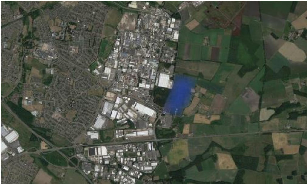
Figure 5: Area of search north of A580 at Knowsley Industrial and Business Park