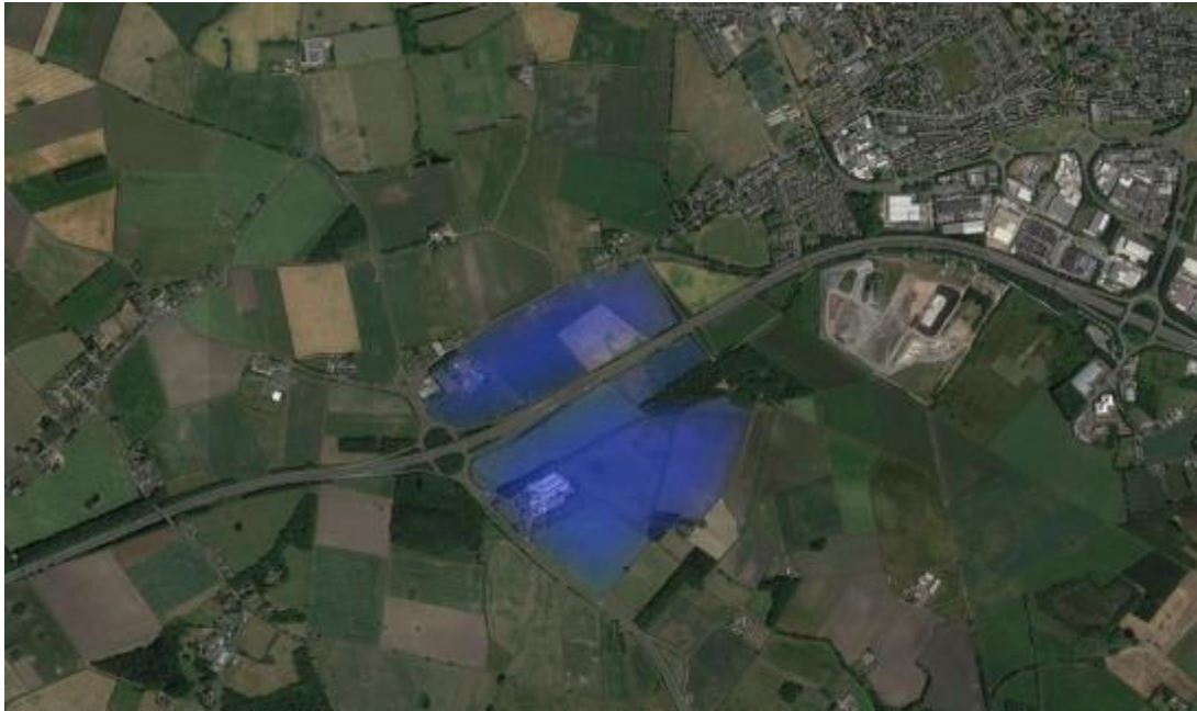
Figure 8: Area of search at Junction 3 M58