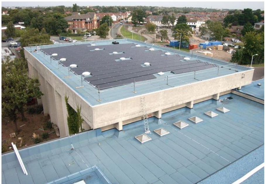
50 kWp solar installation at West Kirby Concourse