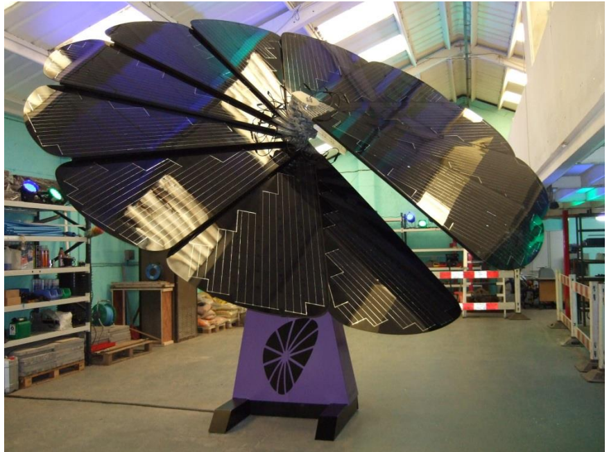
Smart Flower Pop, on display at Mole Group

Changes to the Government's Feed in Tariff (FiTs) scheme have reduced incentives for renewable energy installations. It is likely there was an increase in installations in the run up to December 2015 as people sought to take advantage of the higher incentive rates available prior to the changes being introduced. The lower incentive rates now available will have implications for the feasibility of future proposals.