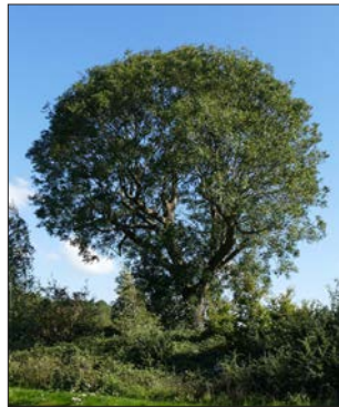
0% Dieback - healthy crown