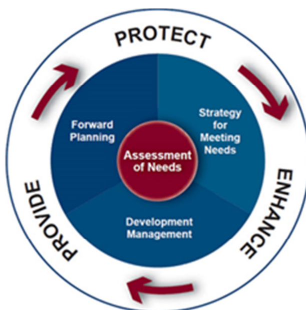
Figure 1: Sport England themes

To provide new playing pitches including other outdoor sports facilities such as greens and courts where there is current or future demand to do so