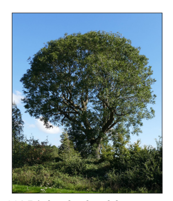
0% Dieback - healthy crown