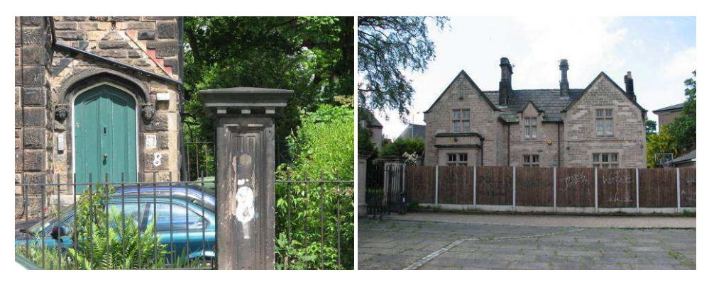
Spray-painted early / original gatepost and poor quality boundary treatment

Buildings are not generally named as they were in the 19<sup>th</sup> century and most are now referred to by house numbers. As a consequence many of the carved names on gateposts are incorrect and residents have used various other means of identifying the number. Some of these are particularly detrimental to the character of the area or potentially damaging to the gatepost. In a number of instances the number has been simply sprayed onto an original gatepost. This has occurred even to gateposts that are supposedly protected by being part of the curtilage of their associated listed building.