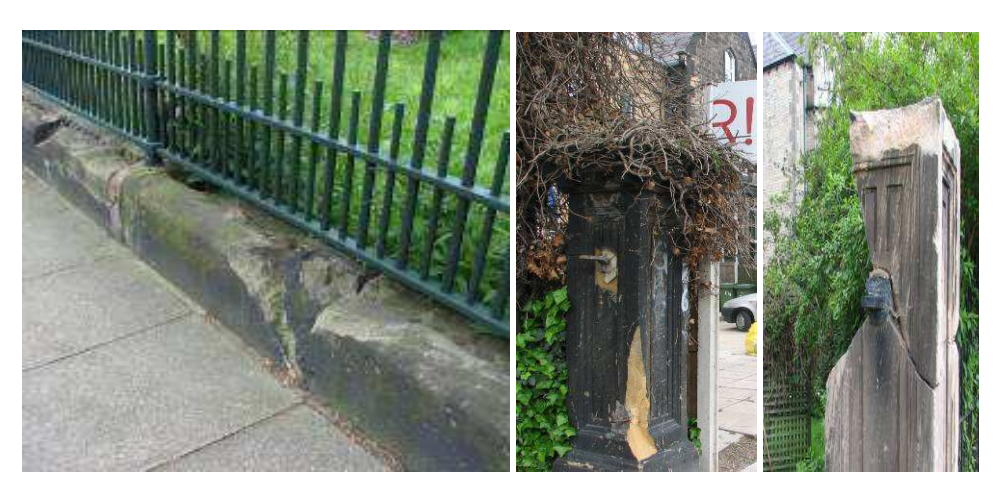
(Left) Damage to original stone plinth; (Middle) dirty / damaged original gatepost that could be carefully repaired; (Right) although a large section of this gatepost has been lost, the remainder is in a fair condition and should be repaired by carefully drilling out any rusting ferrous fixings and piecing in a new section. This may be cheaper than replacing the whole post in reconstituted stone.