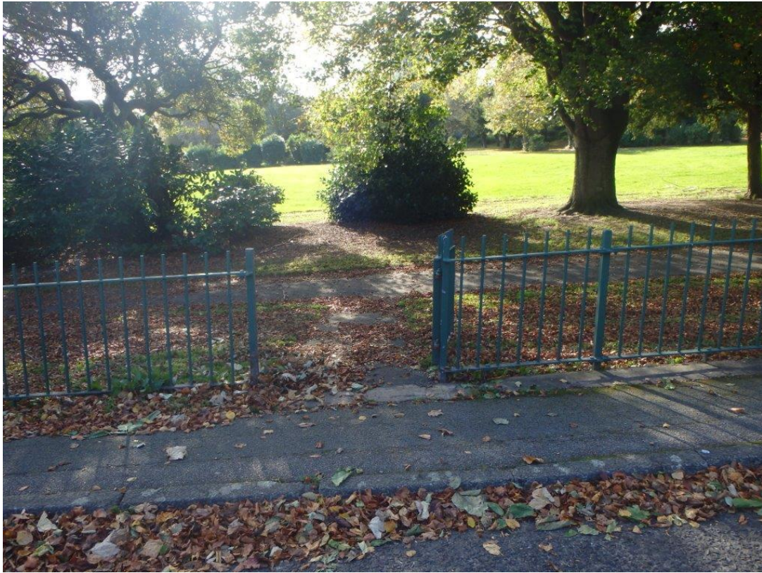
8 - Entrance by roundabout at the junction of Derby Road and Bebington Road