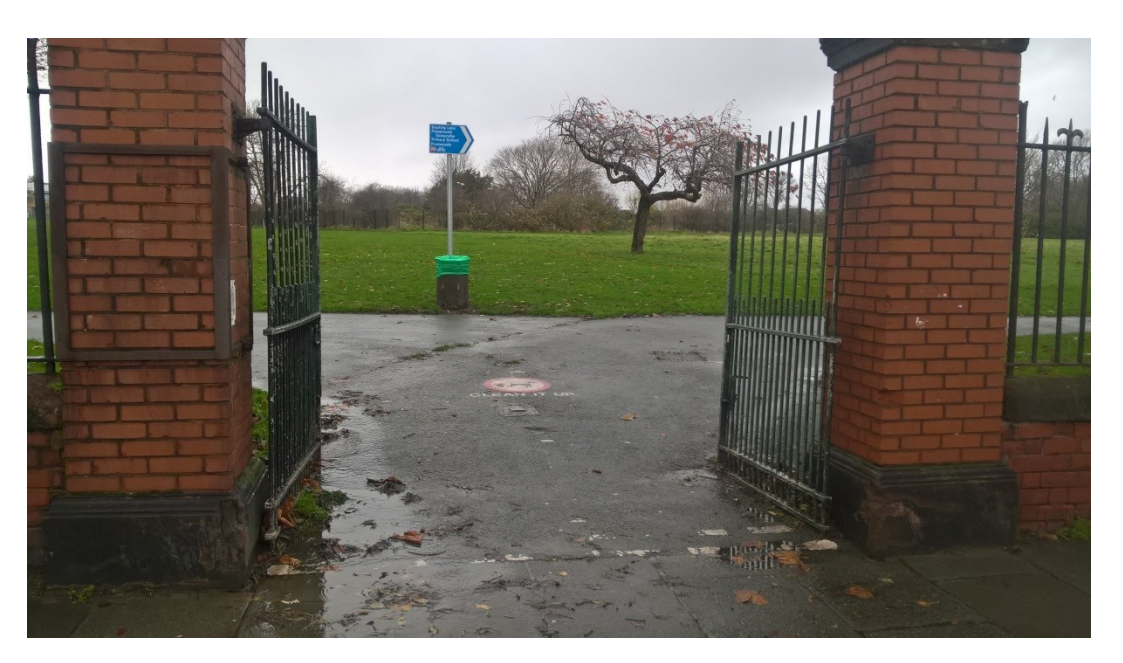
8. Oxton field via Poulton Road

Oxton field /Bowling greens and best entrance for the main lake .and to access the bottom end of Love Lane allotments