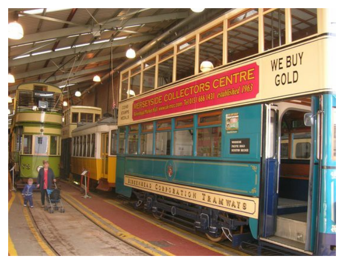
Heritage Site 20 Wirral Transport Museum and Heritage Tramway.

Drivers: Return back to the A41 roundabout, taking the 2nd exit into Canning Street with Cheshire Lines Building on your right & then 3rd available left into Taylor Street to the Transport Museum: