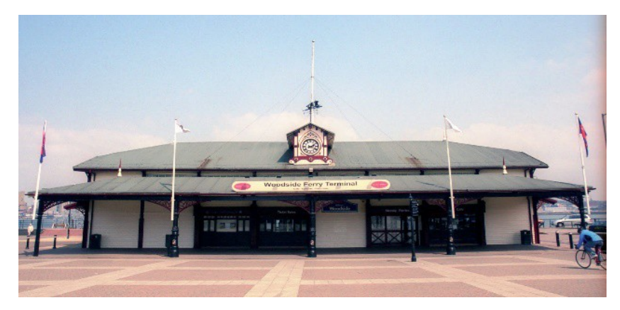
Heritage Site 19 Woodside Ferry Terminal and Submarine.

Drivers: Return back up Shore Road to the A41 roundabout and take the1st left to: