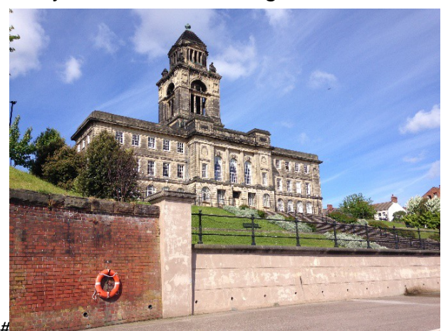
Heritage Site 26: Wallasey Town Hall

Driving: From the roundabout at Seacombe Ferry, follow signs for A 554 to New Brighton initially Church Road and becoming Brighton Street, with Wallasey Town Hall on the right.