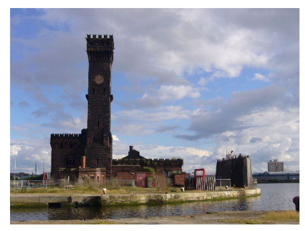
Hydraulic Engine House and Tower.

Designed by J.B.Hartley (1814–1869), the son of Jesse Hartley, the Liverpool dock engineer. it provided hydraulic power for operating the lock gates and bridges of the dock system. The design is based on the Palazzo Vecchio in the Piazza Della Signoria, in Florence. Both the castellated engine house and the 110ft accumulator tower suffered bomb damage in WWII. They were subsequently repaired but the lantern on the top of the tower was never replaced.