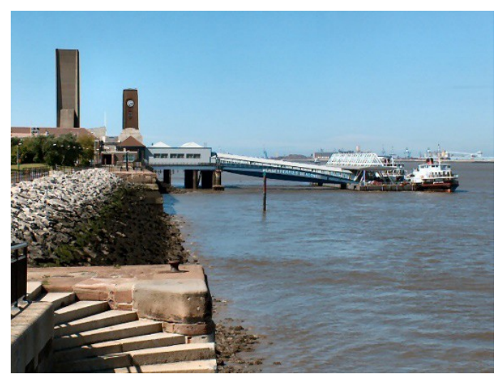
Heritage Site 25 Seacombe Ferry Terminal.

Cycling and driving: Fork right along A554 Birkenhead Road to Seacombe Ferry on the right: