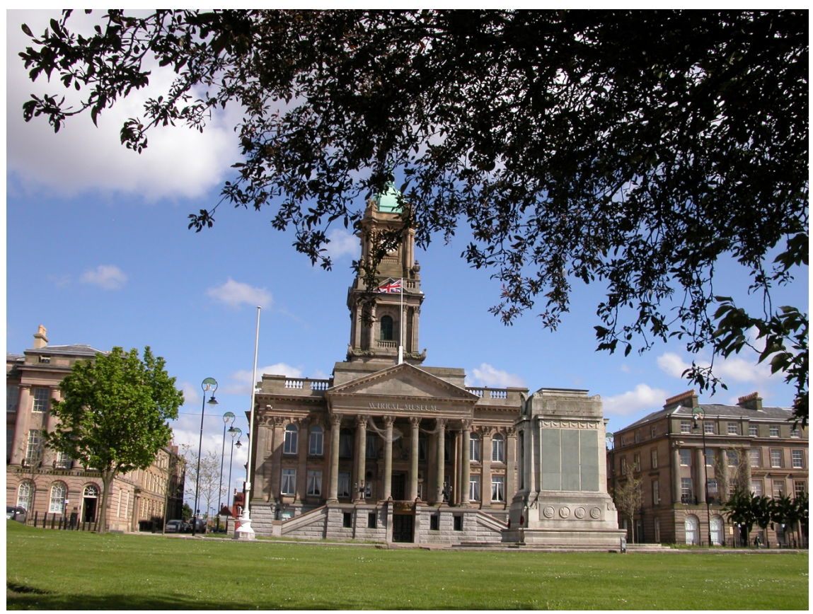
Former Birkenhead Town Hall built between 1883 and 1887 and terraces on the east side of the square.