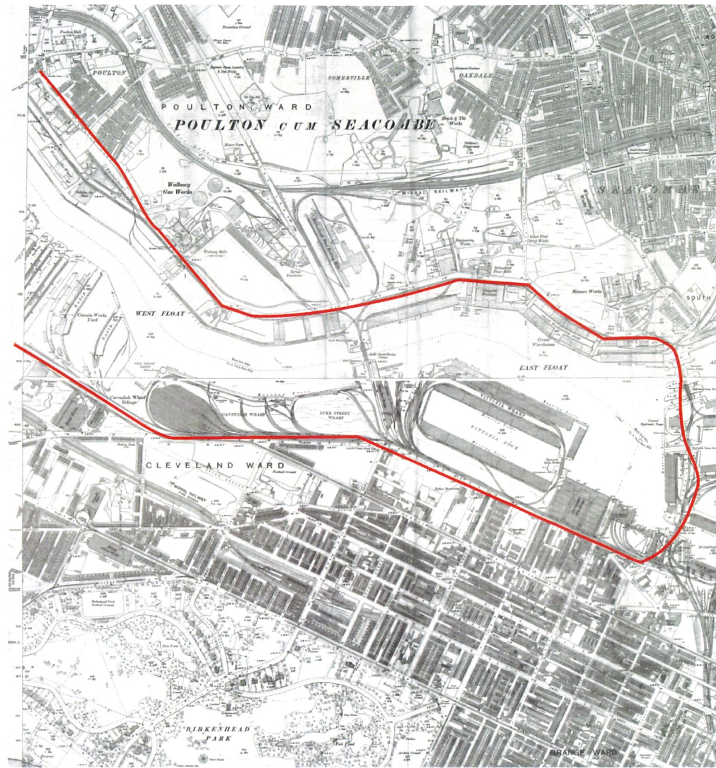
1936 25 inch Ordnance Survey Map; Cheshire Sheets VII.15 & XIII.3