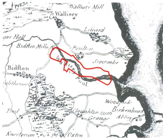
Burdett's map of 1797