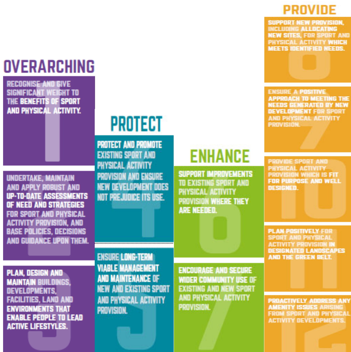
Figure 1.2: Sport England's 12 Planning Principles