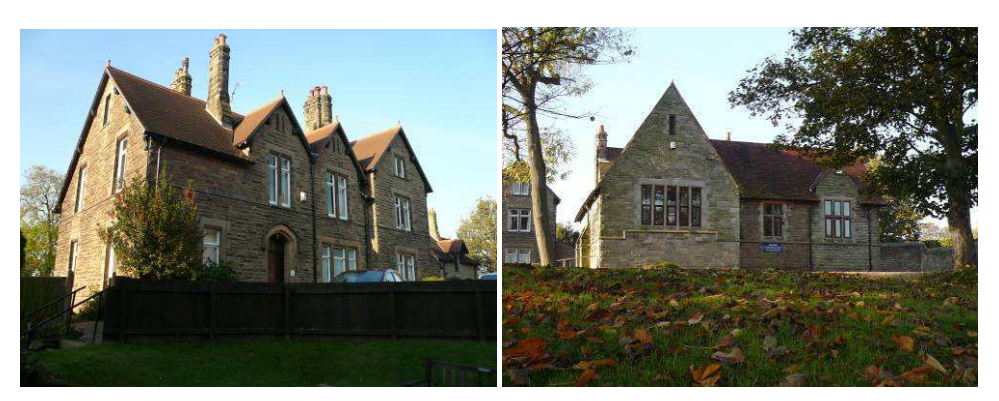
Buildings of a Vernacular Revival / Gothic influence in the conservation area

Arts and Crafts – buildings with particular attention to detail and using elements of traditional craftsmanship in their decoration. The Fox and Hounds Public House has decorative leading to its window panes, some decorative timberwork and oriel windows. All these features are reminiscent of Arts and Crafts buildings, although it is simpler in its level of decoration. Similarly, no. 136 / 138 Barnston Road, is an attractive semi-detached building, drawing its form from Arts and Crafts houses built a couple of decades earlier. However, its level of decoration is noticeably simpler. The design and good maintenance of the building possibly indicates that it may be, or may have been an estate cottage.