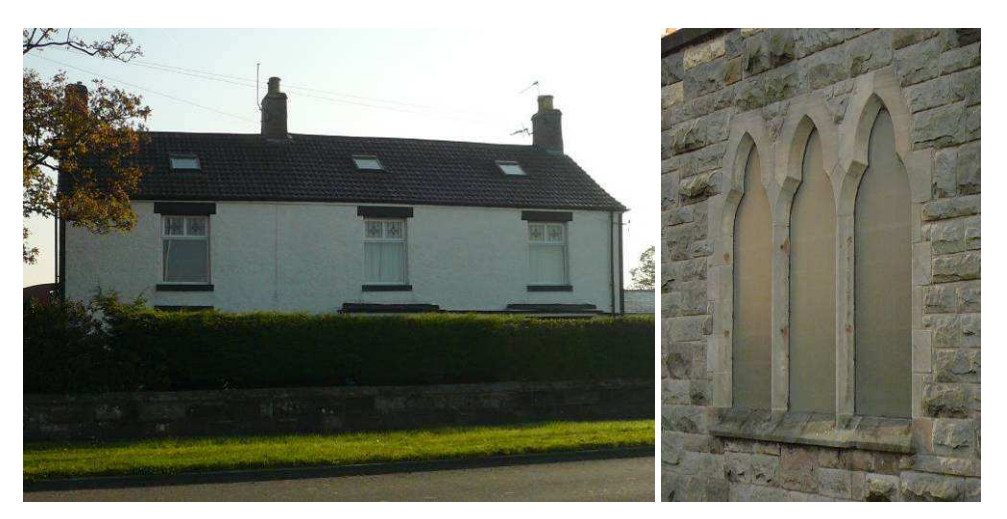
(left) Changes to the windows and roof covering adversely affect the building's character and its contribution to the conservation area. (right) Although probably necessary to prevent damage by vandals, the application of perspex over the leaded lights of Christ Church's windows makes it impossible to appreciate their intricacy from the outside.