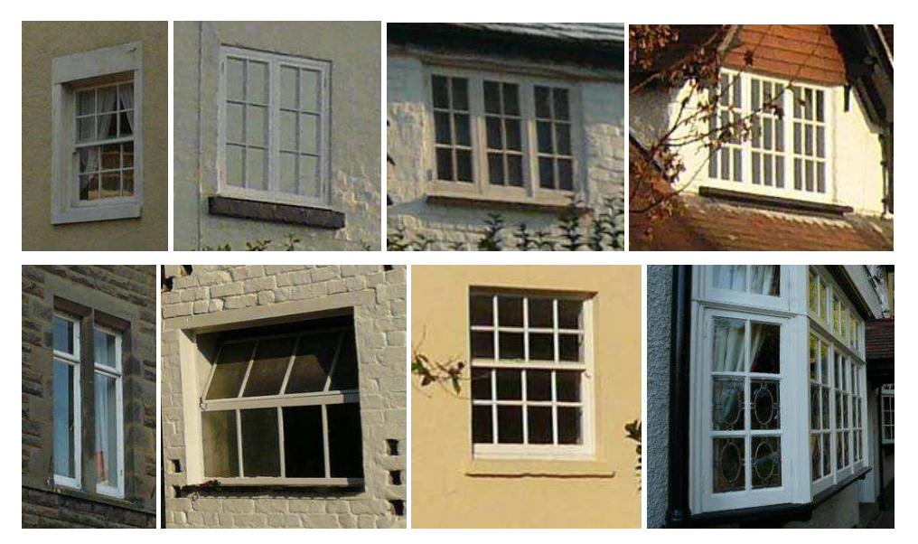
Windows in the conservation area