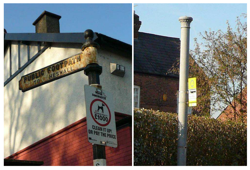
Cast iron sign and post.

5.4.8 Public realm features within the village are relatively simple and often of a traditional form. There are a few examples of historic public realm features such as signs, posts and gates constructed of, or at least made to appear to be of either cast or wrought iron. Whilst generally more modern, simple timber signs and posts are appropriate within the conservation area and can enhance its appearance