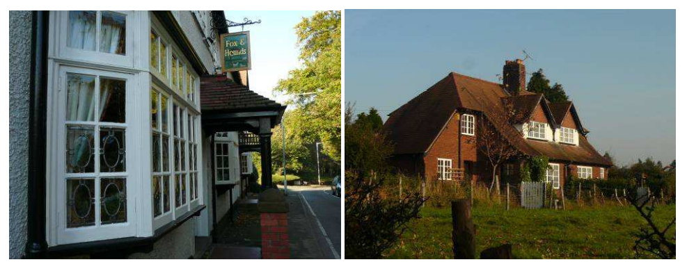
Buildings within the conservation area with details / form originating in the Arts and Crafts style.

Arts and Crafts – buildings with particular attention to detail and using elements of traditional craftsmanship in their decoration. The Fox and Hounds Public House has decorative leading to its window panes, some decorative timberwork and oriel windows. All these features are reminiscent of Arts and Crafts buildings, although it is simpler in its level of decoration. Similarly, no. 136 / 138 Barnston Road, is an attractive semi-detached building, drawing its form from Arts and Crafts houses built a couple of decades earlier. However, its level of decoration is noticeably simpler. The design and good maintenance of the building possibly indicates that it may be, or may have been an estate cottage.