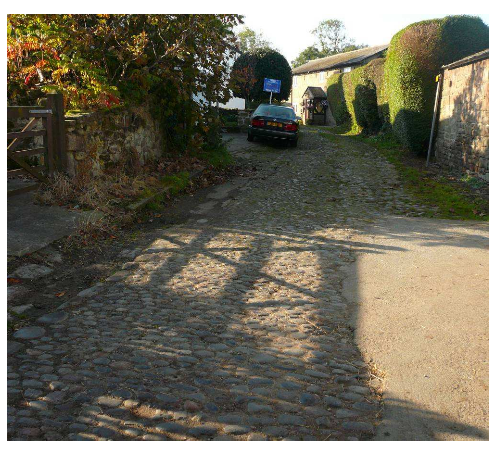
Cobbled surface to the lane leading south-westwards from Beech Farm