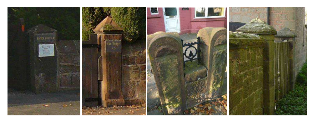
Stone gate posts with the conservation area

5.4.7 Gateposts are either of a simple timber construction (to farm buildings) or of a large, simple / unornamented sandstone shape. Both are of an agricultural character.