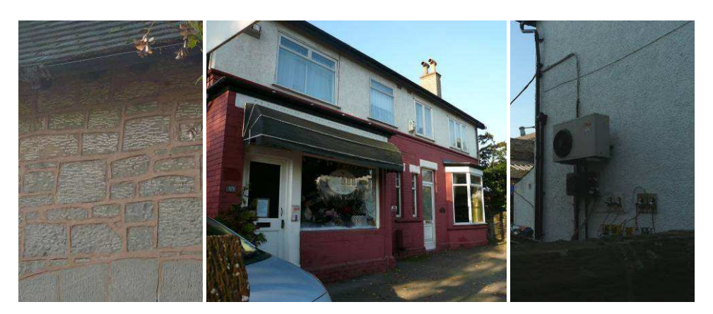
Management issues with the conservation area: (left) obtrusive modern pointing over the face of stonework. Artificial colorants are also used giving it an unnatural colour; (middle) Painted brickwork and inappropriate modern windows; (right) An air conditioning unit mounted in an obtrusive position on the Fox and Hounds.