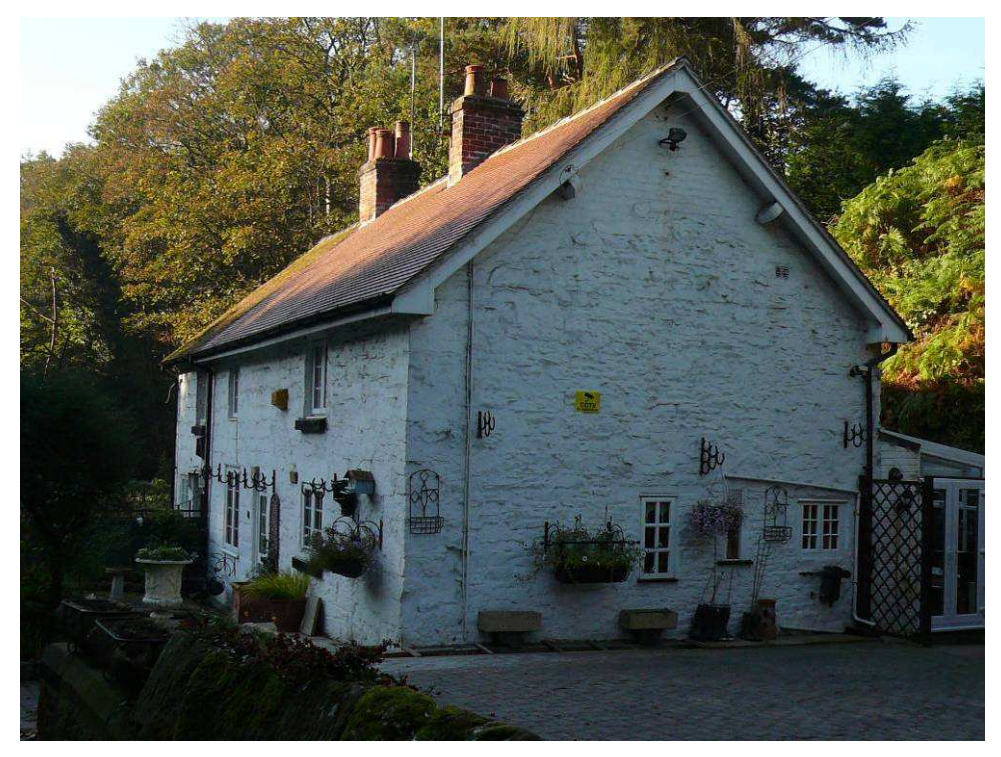
A particularly historic house that has unfortunately had a number of modern alteration carried out, including the installation of UPVC windows and boxed soffits. These changes particularly jar with the original character of the building.

6.4.2 The foremost alteration to historic fabric within the conservation area is the replacement of original doors and windows. These alterations are often well intentioned – to improve the thermal or acoustic performance or to reduce maintenance requirements for instance. However, the visual effect of the replacement windows, particularly on the architecturally simple buildings, is immense. The original sash windows would have had very slim profiles, giving an elegant appearance. In contrast, a UPVC or aluminium replacement, particularly when holding a thick double glazed unit, has