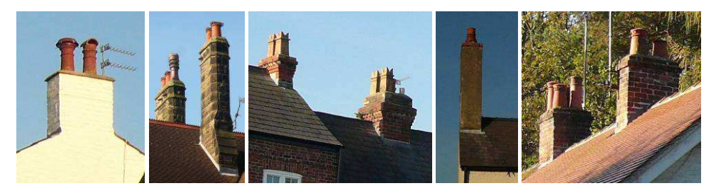
Chimneys within the conservation area.

5.4.5 Chimneys play a part in the visual composition of most buildings, although they are typically of a simple rectilinear design, with little in the way of projections. Only a few buildings have tall, visually dominant chimneys; these buildings tend to be of a higher status. Terracotta or buff clay pots of varied design are generally seen on top of most stacks.