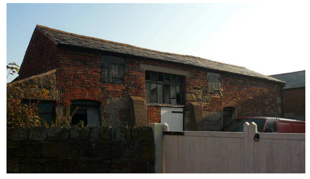
Agricultural building in the conservation area