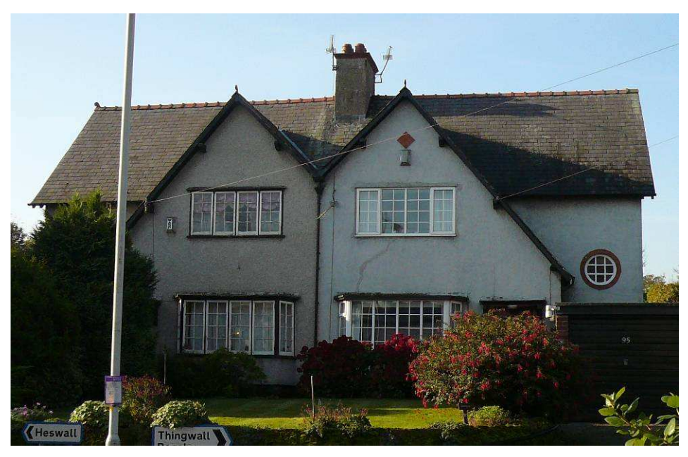
Replacement windows within the conservation area: this photo illustrates that even though UPVC windows can be manufactured to approximately the same form as an original casement, they are of a lesser quality visually In this instance the opening lights require much larger frames than the fixed ones and the intermediate mullions (painted black on the originals) are lost. The glazing beads are within the double glazed unit, instead of forming an integral part of the casement. This is immediately apparent and this adversely affects the visual character of the window.

6.4.3 The reconfiguration of opening panes (particularly when replacing sashes with top-hung casements) dramatically changes the architectural character of the building. Where windows are replaced in timber, these can also adversely affect the appearance of the building where the original detailing is not followed and often the quality of the timber is far substandard to the original, giving it a short lifespan. Secondary glazing can be used and will always produce a more satisfactory visual result than a double glazed equivalent. The use of UPVC windows is fairly prevalent amongst the unlisted buildings.