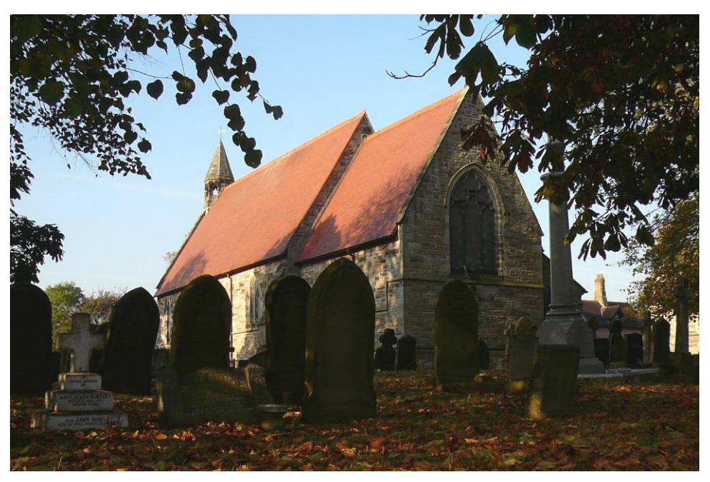
Christ Church, designed by prominent London based architect G.E. Street

Cheshire (1874-5), All Saints in Bolton (1869-71), St Margaret, Toxteth (1868-9) and St Nicholas, Whiston (1864-8).