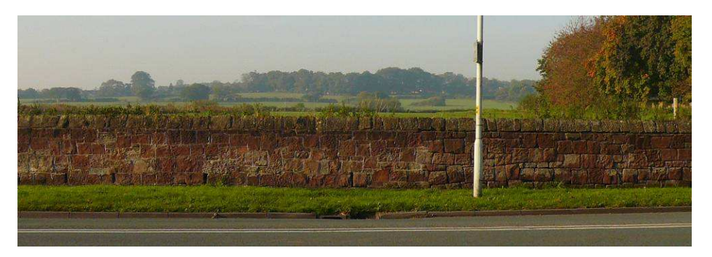
Stone boundary walls in the conservation area.