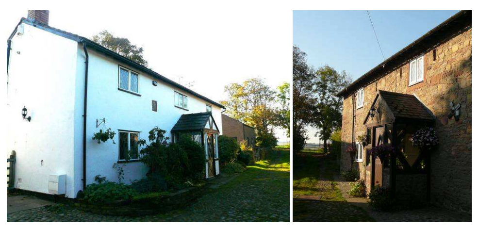
Extensions within the conservation area. The left hand photo shows a cottage that has been extended in recent years by about 50%. The modern render over both the older and modern parts confuses the original form. The right hand photo illustrates how an attractive porch added to the front of a building (together with other changes) can have an adverse effect on its original agricultural character.

6.3.1 There are relatively few recent extensions within the conservation area of a significant size. The most unsympathetic of extensions are those that confuse the original form of the building and lessen the overall perception of quality. Good extensions either use the materials and detailing of the original building or are of a modern design and construction that is of a high quality but adequately contrasting to the original. In conversion a number of former agricultural buildings, forms associated with domestic buildings, such as porches, have been attached to the original structure.