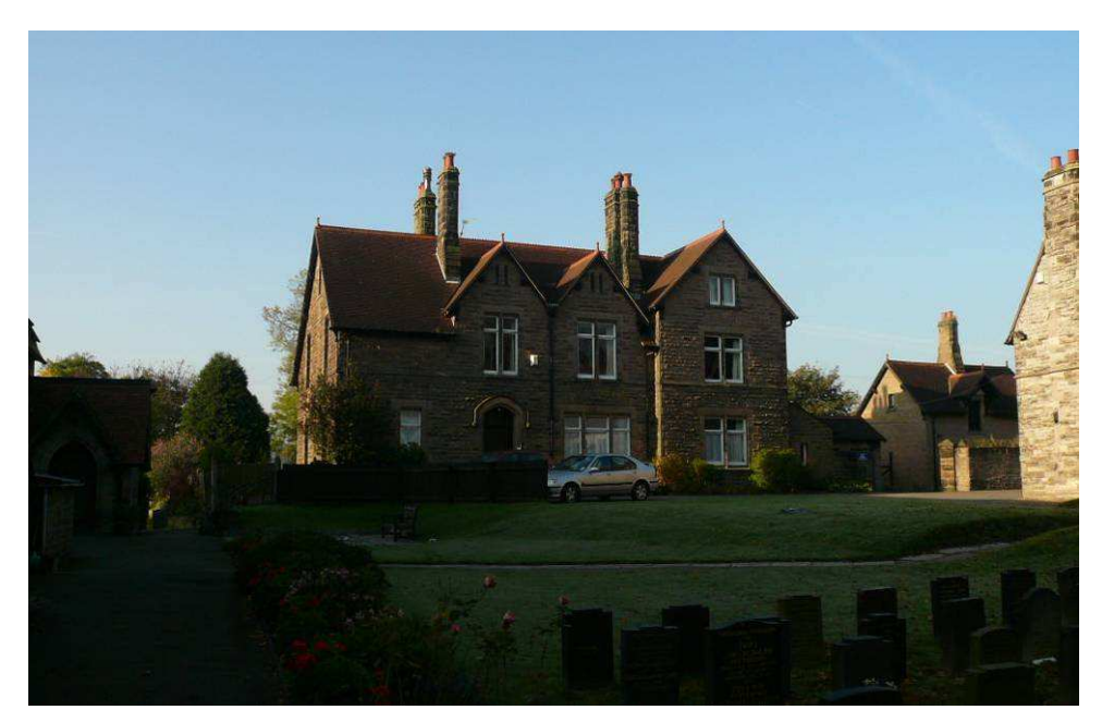
Small green in front of the vicarage

3.2.1 The character of Barnston is distinctly one of a small rural village that has gradually grown up over a number of centuries. Buildings are all located along or near Barnston Road, Storeton Lane or the small lane leading from between Beech Farm and Laburnum Cottage. Due to the linear nature of the village, few defined spaces are created. There is a small widening of the road at Beech Farm, which marks the site of the former village green. The church, vicarage and village hall (former school) are positioned relative to each other to create an attractive small green.