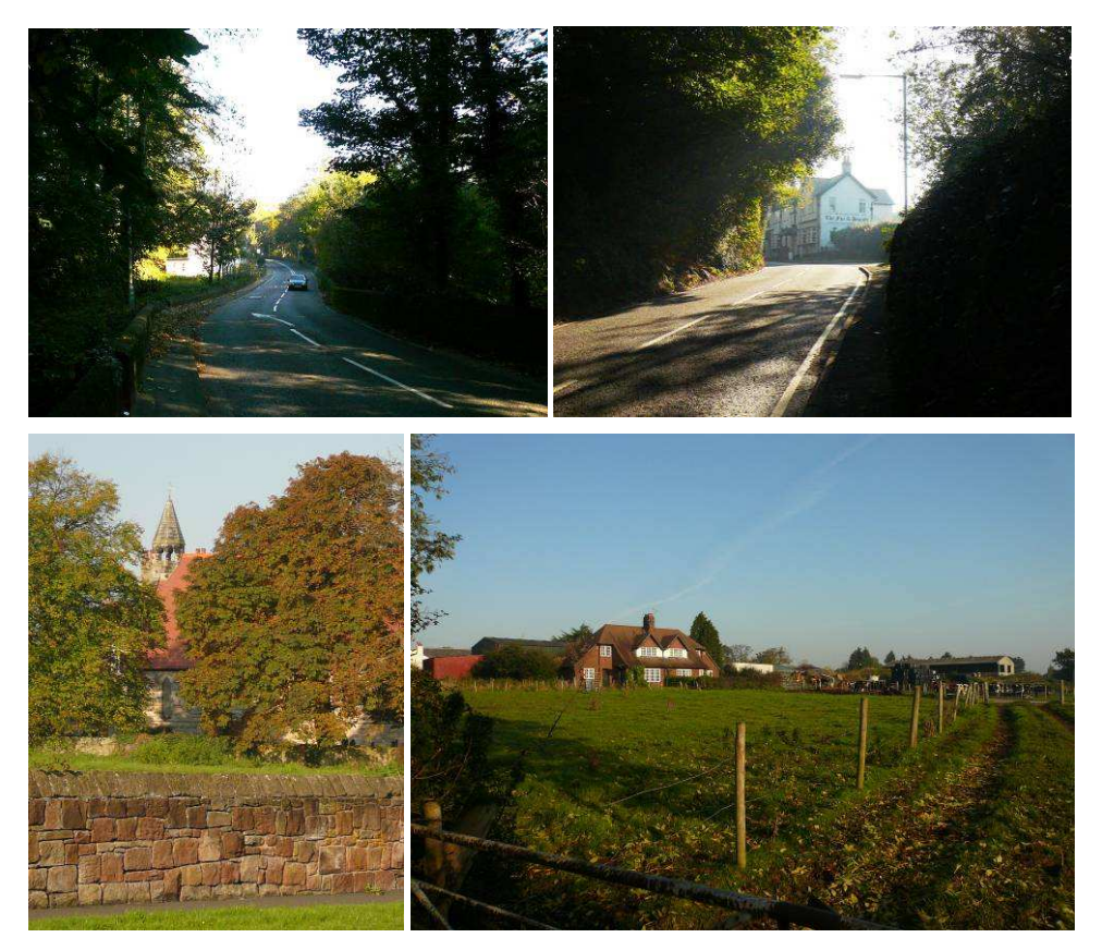
(Top left) View towards no. 109 / 111 Barnston Road; (top right) View from Barnston Dale up towards the Fox and Hounds; (bottom left) Glimpse view towards the Church from entering the conservation area from the south-east along Barnston Road; (bottom right) View towards 136 / 138 Barnston Road on entering the conservation area from the south-east