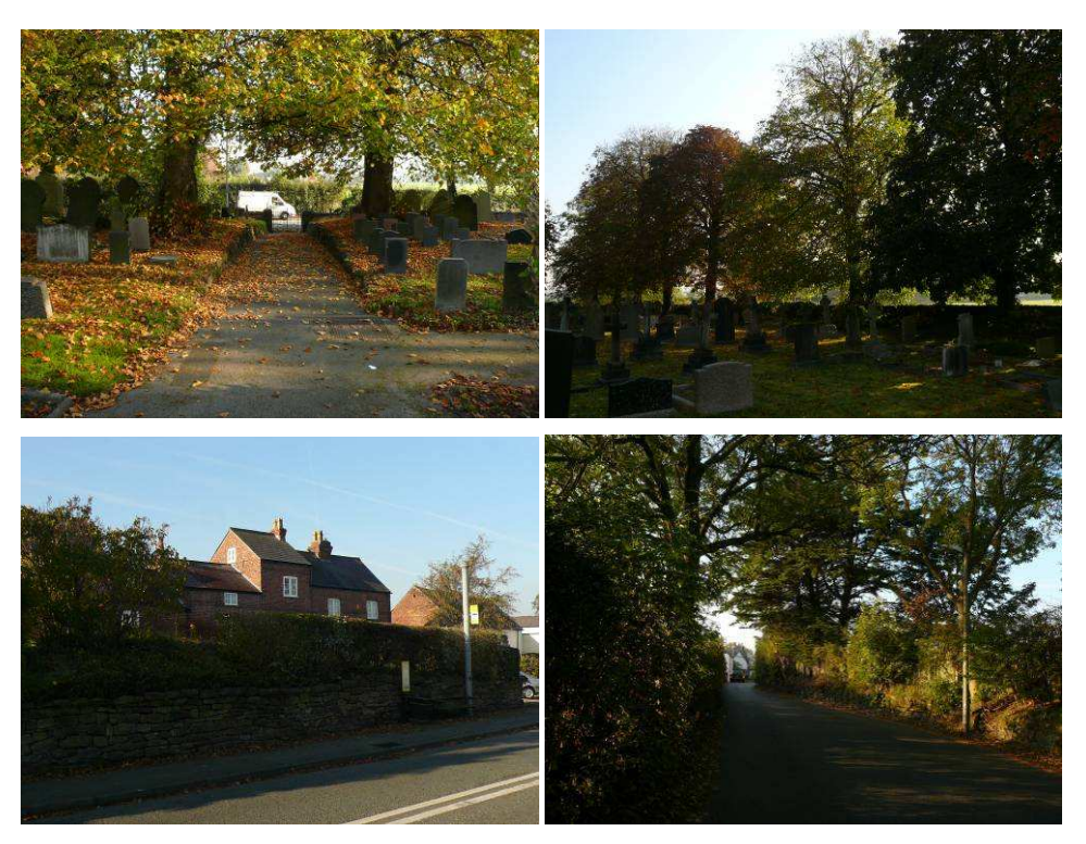
(Top left and right) trees within the church yard; (bottom left) an attractive hedge along the front boundary to a dwelling; (bottom right) trees and hedges / shrubs along Storeton Lane.