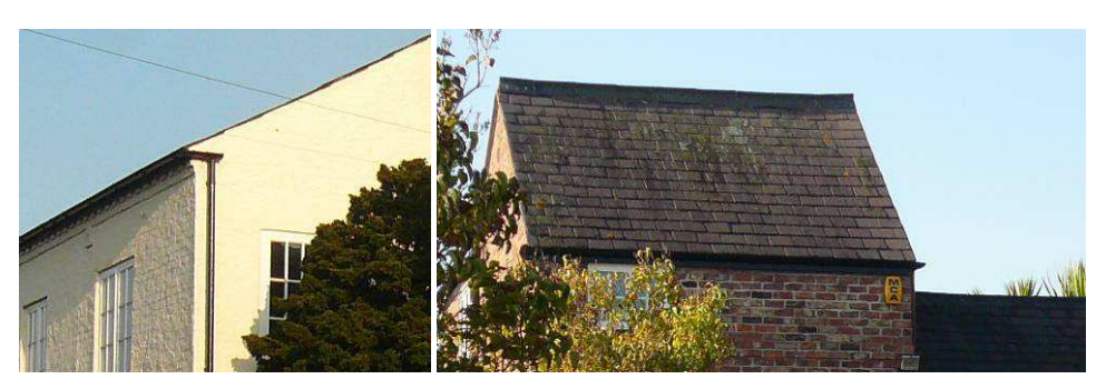
Roof details in the conservation area

5.4.6 Roof details to almost all buildings within the conservation area are, or once would have been, very simple. There are few barge board or parapets on gables. Eaves have little in the way of an overhang and any detail is provided by 1 or 2 courses of projecting / dentilled brickwork. Ridges are generally unadorned.