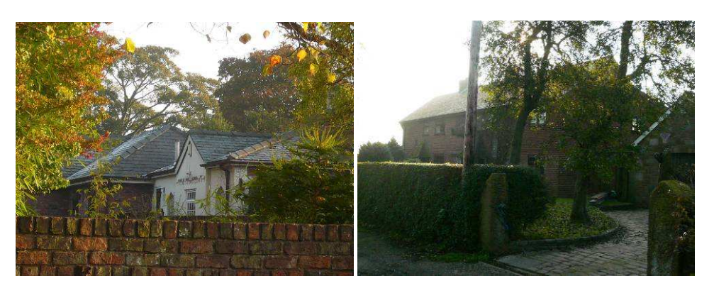
Modern buildings within the conservation area